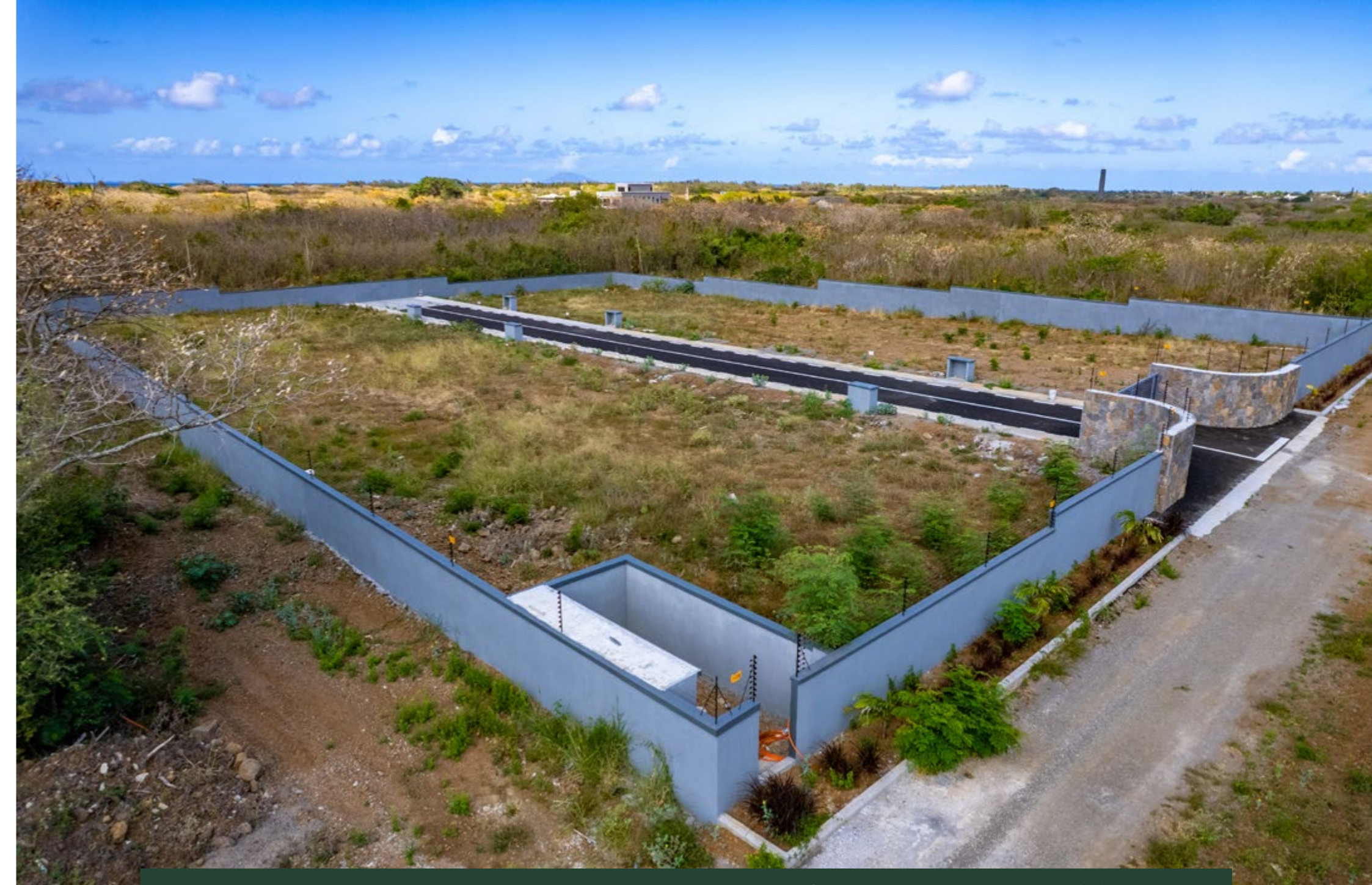
DOMAINE DE MONT MASCAL - 10 SERVICED PLOTS IN PROGRESS