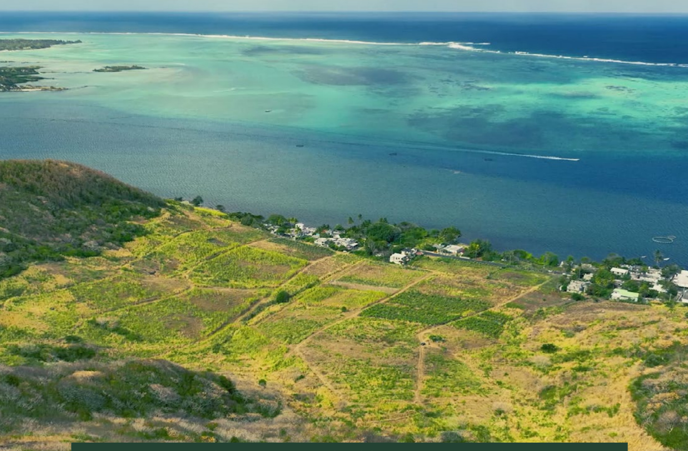
DOMAINE DE POINTE AUX FEUILLES 41 PLOTS - PROJECT DELIVERED!