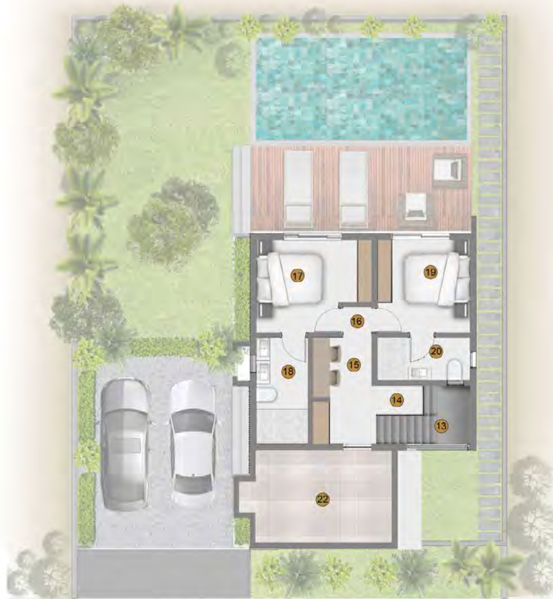
FIRST FLOOR/PREMIER ÉTAGE